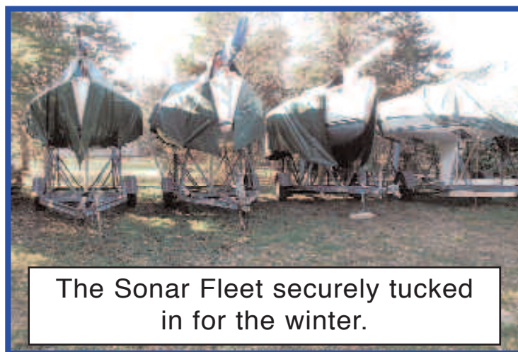
The Sonar Fleet securely tucked in for the winter.

In June, the Fleet will host a social event that will include opportunities to go out for a leisurely sail and if you are up for even more fun, you can participate in a "mini non-competitive race" designed specifically to give you a "Sonar Crew" sailing experience.