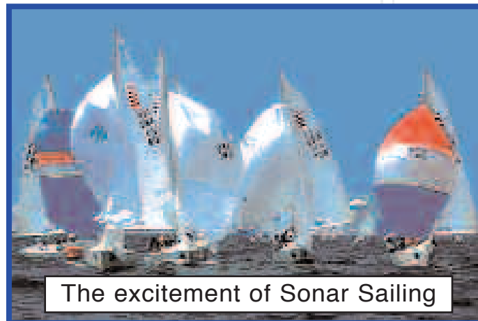
The excitement of Sonar Sailing

Because sailing is so much fun, the Fleet wants to encourage more Falmouth Yacht Club members to come on board.